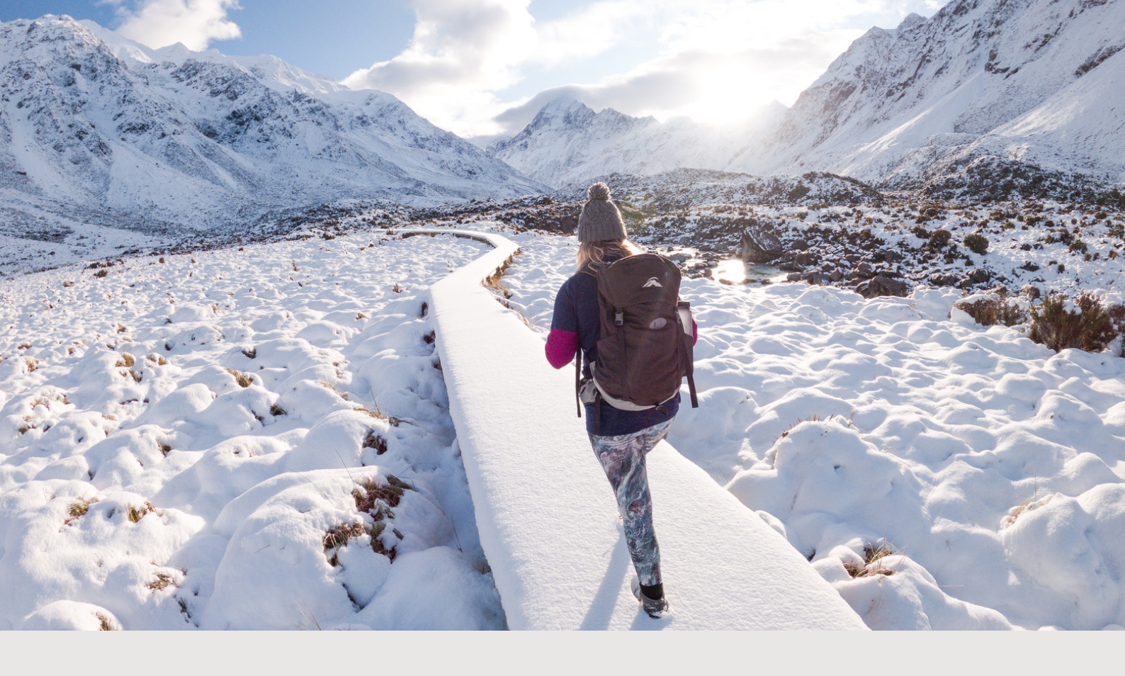
EXHIBIT SPACE & PRICING

The Outdoor Expo offers a mix of indoor and outdoor spaces to accommodate a wide range of exhibitor needs, ensuring visibility and engagement with your target audience. In our inaugural show, we've embraced a straightforward pricing approach to ensure clarity and fairness for all Exhibitors.